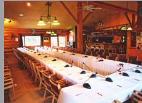
Silver Buckle Lounge