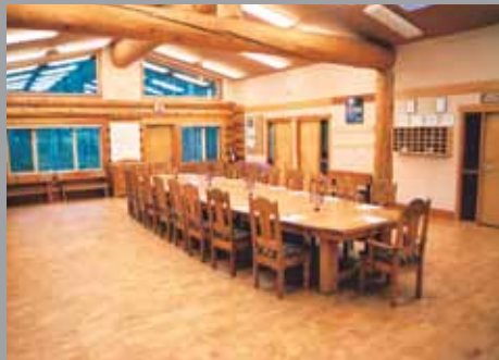
Mountain Guide Room