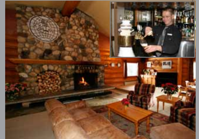
Silver Buckle Lounge