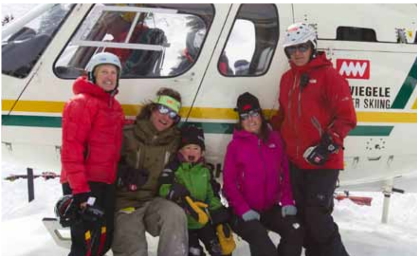
Family owned and operated since 1970